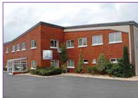
the food hub

Today, in overall terms the food hub provides total employment of 35 people across 5 tenant companies with 26 jobs in the pipeline with major job creation announcements pending for two new high potential start up projects.