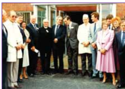
Official Opening 1983