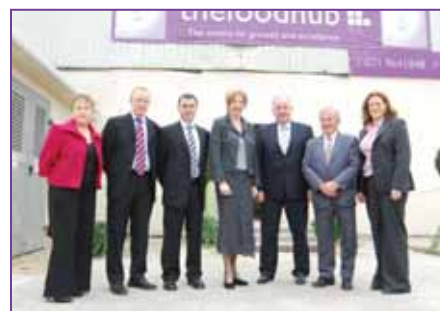
Official Opening 2007